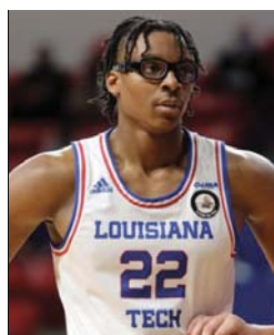
Either Louisiana Tech or Sam Houston will enter the C-USA Tournament as the No. 1 seed.